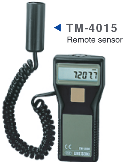
◀ TM-4015 Remote sensor