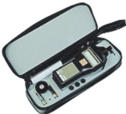
▲ TM-5000 0.1 rpm resolution